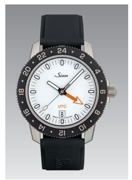
105 St Sa UTC W : black silicone strap with toothed buckle. ø 41 mm (scale: 1:1)