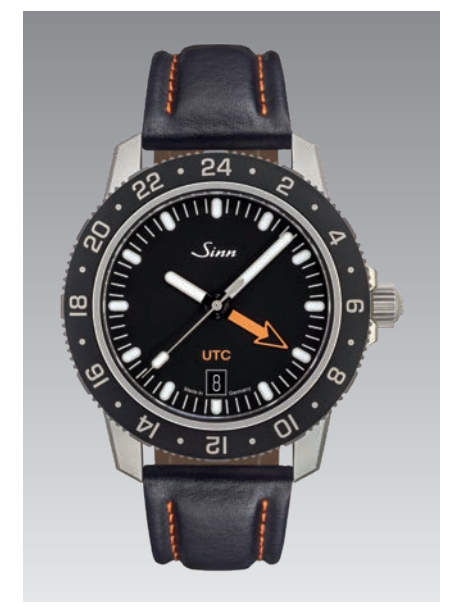
105 St Sa UTC : black cowhide leather strap with contrasting stitching.ø 41 mm (scale: 1:1)