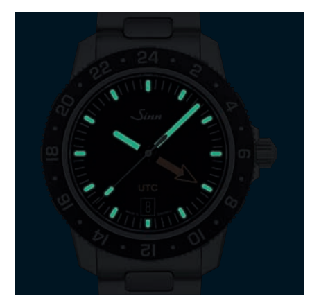
105 St Sa UTC - luminous design. (scale: 1:1)