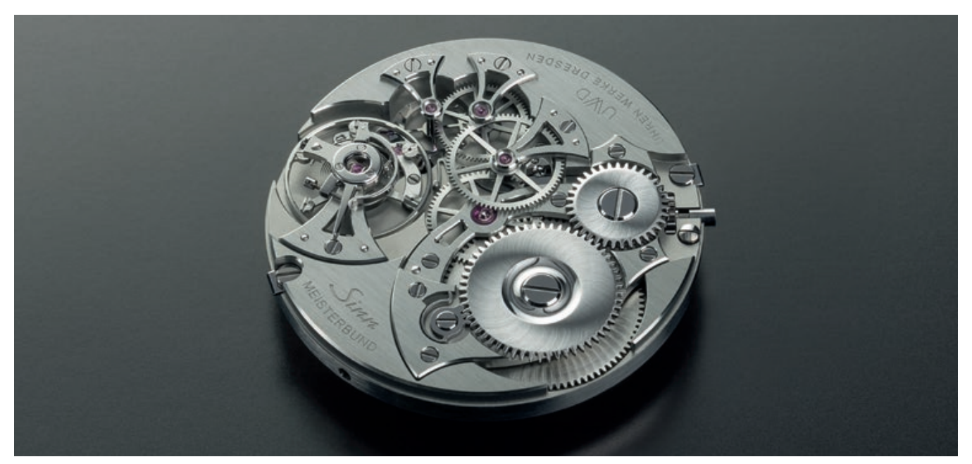
The fine, exquisitely decorated hand-wound calibre UWD 33.1 has a power reserve of 55 hours. The six eccentric weights on the balance rim for precisely balancing the balance system are also clearly visible. In accordance with the functional principle of a swan-neck regulator, the regulator system enables zero-play precision adjustment and isochronal adjustment of the watch.

UWD is responsible for manufacturing the high-quality hand-wound calibre UWD 33.1, which proved hugely successful in the rose gold edition, where it was used for the first time in series production.