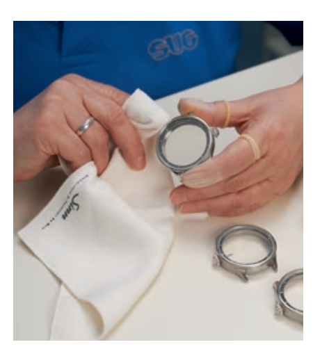
It takes a "keen eye" and years of experience to finish the surface of a case.