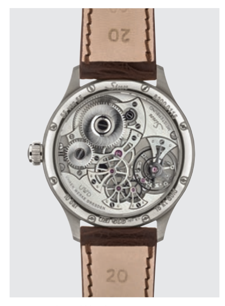
Back view of the 6200 WG Meisterbund I with engraved limited-edition number. (Figure: 1:1)