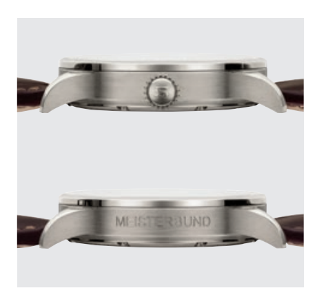
The finely satinised sides of the 6200 WG Meisterbund I with "MEISTERBUND" engraving. (Figures: 1:1)