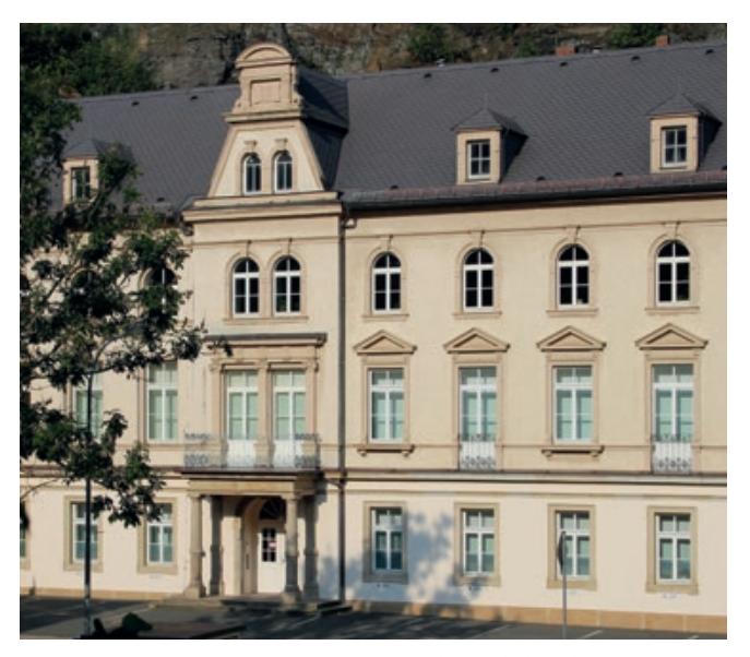
The building of the Sächsische Uhrentechnologie GmbH (SUG) in Glashütte is on the "Glashütte watch mile", in the immediate vicinity of the most prestigious Glashütte watch manufacturers. The historic, listed façade (pictured) once adorned Dresden's Kaiserhof Hotel, built in 1889.