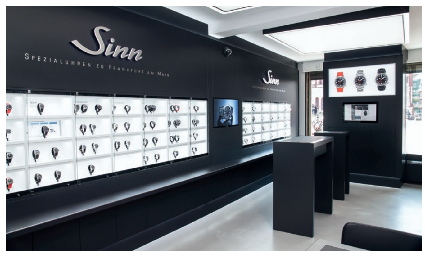
A view of our Römerberg 34 branch salesroom in Frankfurt am Main city centre – the historic "Haus zum Goldenen Rad" directly opposite the Frankfurt Römer, the city hall since the 15th century.