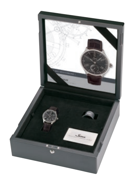
The 6200 WG Meisterbund I comes in a fine wooden case (pictured right) with an alligator leather strap, available in the colours mocha (pictured left) or black (pictured centre). Also contained in the case is a brochure, an Eschenbach watchmaker's loupe, a care cloth and a warranty card. Watch diameter: 40 mm. (Figures left and centre 1:1)