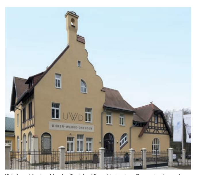
Historic architecture blends with state-of-the-art technology. The production and business premises of the Uhren-Werke-Dresden (UWD) are located on Ullersdorfer Mühle – a very special place on the edge of the Dresden Heath.