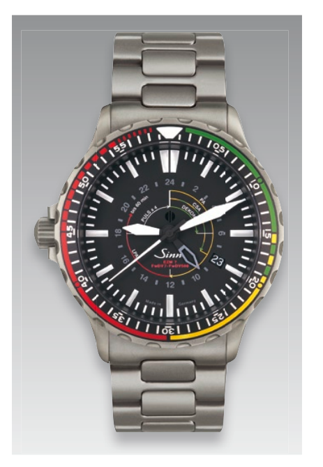
EZM 7: Case and stainless steel bracelet featuring TEGIMENT technology. Solid stainless steel bracelet with fold-out overall extension. Ø 43 mm (scale: 1:1)