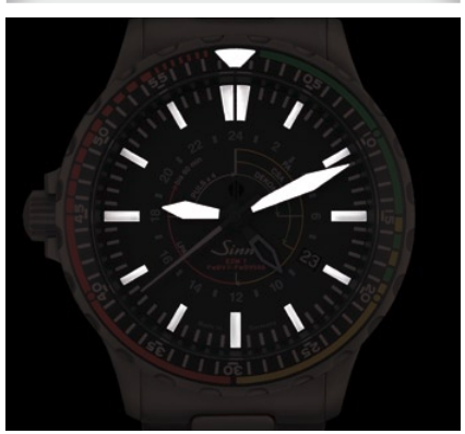
Model EZM 7 – Luminous. (scale: 1:1)