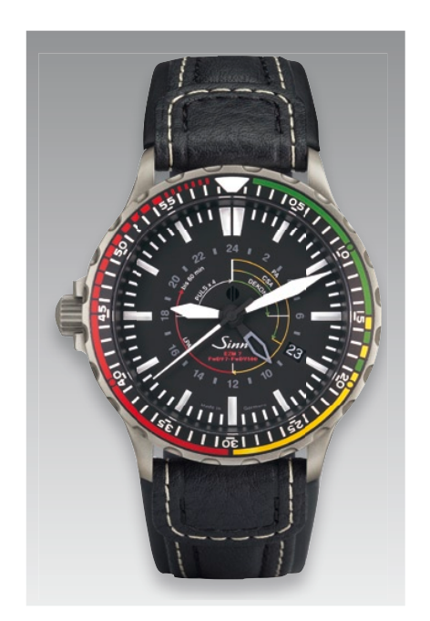
EZM 7: Cowhide strap with contrast stitching, integrated in case. Ø 43 mm (scale: 1:1)