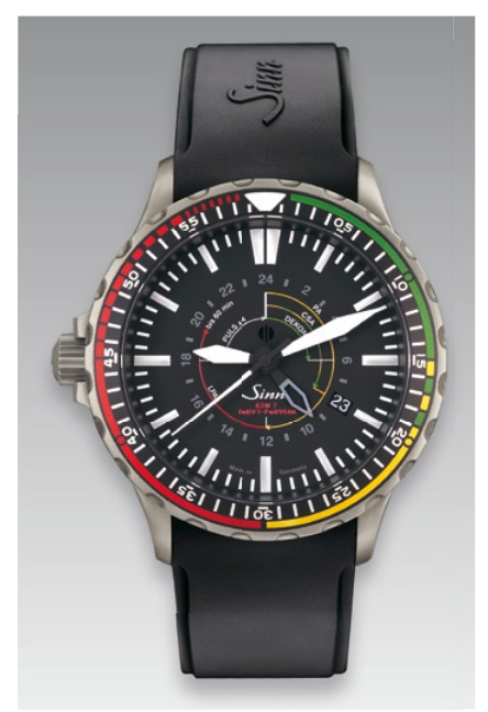
EZM 7 with silicone strap. ø 43 mm (scale: 1:1)