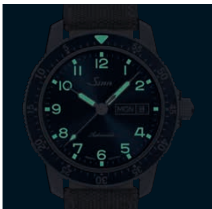
104 St Sa A B E – luminous design. (Fig.: 1:1)

The 104 St Sa A B E model comes with two canvas leather straps.