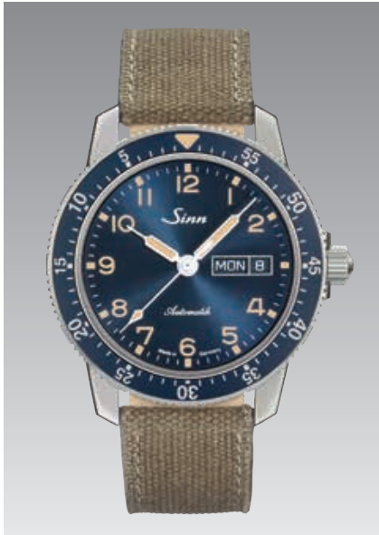
104 St Sa A B E: sand-coloured canvas leather strap. Dark-blue dial with sunburst decoration. ø 41 mm (Fig.: 1:1)