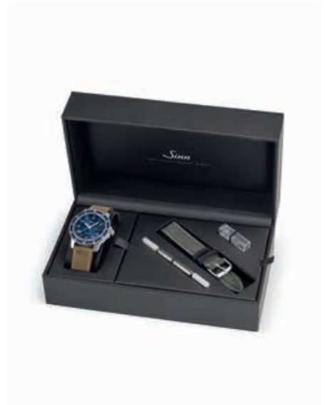
The watch comes in a fine case with one grey and one sand-coloured canvas leather strap, band replacement tool, spare spring bar and a brochure.