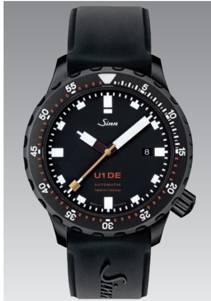
U1 DE with black silicone strap. ø 44 mm (scale: 1:1)