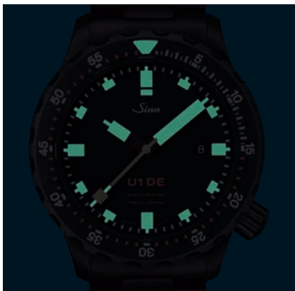
U1 DE – luminous design. (scale: 1:1)