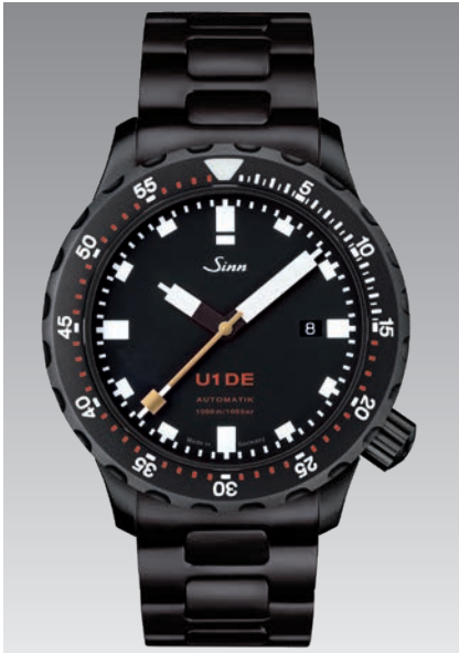
U1 DE with solid bracelet in stainless steel with Black Hard Coating. ø 44 mm (scale: 1:1)