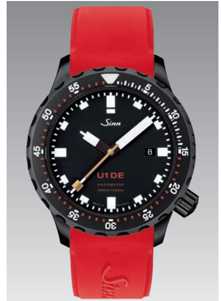
U1 DE with red silicone strap. ø 44 mm (scale: 1:1)