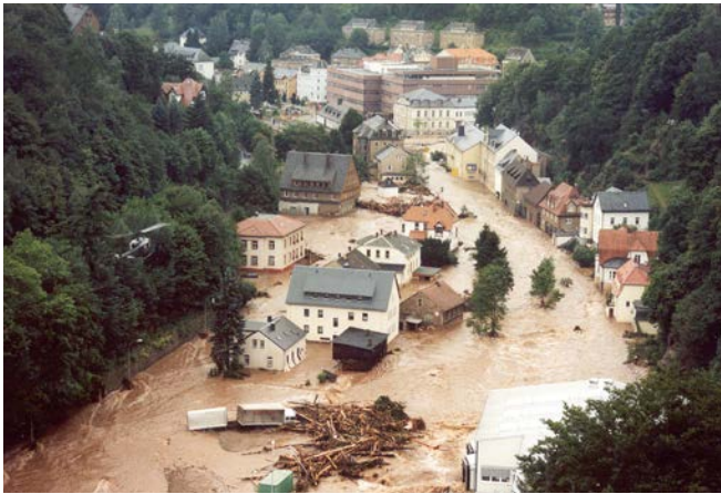
The flood of 2002 was also disastrous for eastern Germany and resulted in a complete write-off for SUG, which had only been established in 1999.

after SUG was founded in 1999. The disastrous flood of 2002 resulted in a complete write-off for the company, which was then forced to start over from scratch. They also weathered the financial crisis of 2008 and the watchmaking crisis of 2016 together. Despite all these trials, they managed to raise SUG to a technical standard that now fulfils the highest demands in terms of technology and quality.