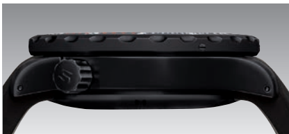
Back and side views. (scale: 1:1)