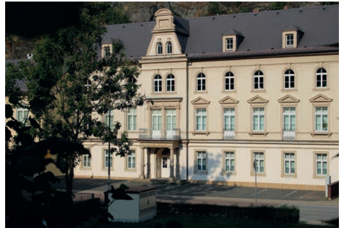
Dresdner Strasse 5 in Glashütte: SUG's production facility is located here in its own company building on the popular 'watch mile', surrounded by prestigious watchmakers.