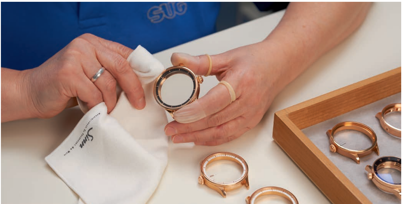
Manufacturing watch cases is a highly demanding task, often requiring genuine craftsmanship. Even assembly is subject to the highest quality standards.