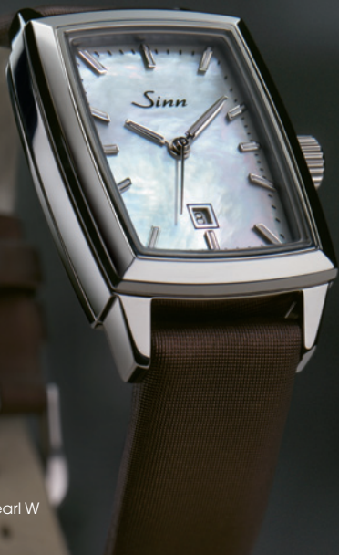
243 Ti Mother-of-pearl W